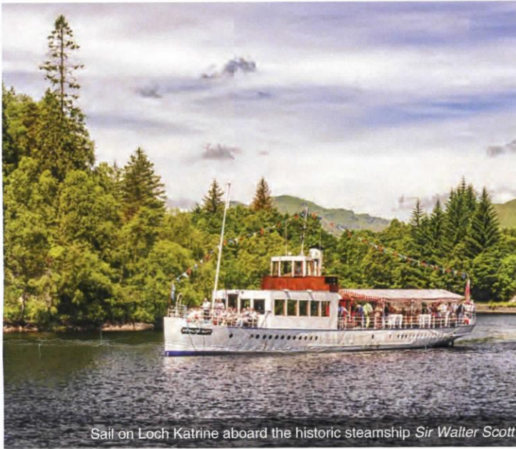
Sail on Loch Katrine aboard the historic steamship Sir Walter Scott