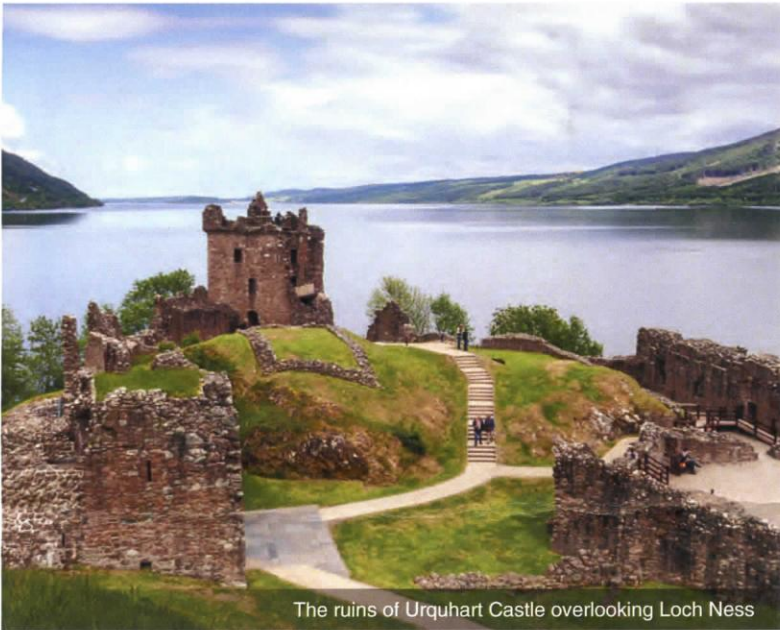
The ruins of Urquhart Castle overlooking Loch Ness

with dramatic scenery and striking architecture. During the panoramic city tour, see the historic Old Town and the elegant Georgian New Town, both UNESCO World Heritage Sites. Visit the city's icon, Edinburgh Castle, perched high atop a hill, offering panoramic views of stately mountains, rolling hills and lovely countryside. Inside the castle, stand in awe of the Scottish Crown Jewels, featuring the crown, sword, and scepter, which are among the oldest regalia in Europe. After free time for lunch on your own, depart for Roslin, a tiny village outside Edinburgh, where you visit Rosslyn Chapel. This 15th-century church is famous for its decorative art and mysterious associations with the Knights Templar and the Holy Grail. This evening, enjoy dinner and a traditional Scottish show featuring local music and dance. Meals: B, D