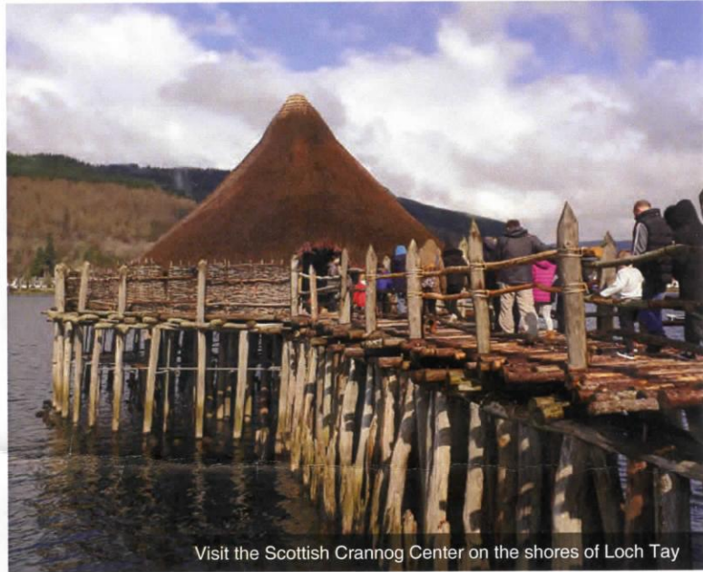
Visit the Scottish Crannog Center on the shores of Loch Tay

DAY 1 Depart the USA: Depart your gateway city on an overnight flight to Glasgow, Scotland.