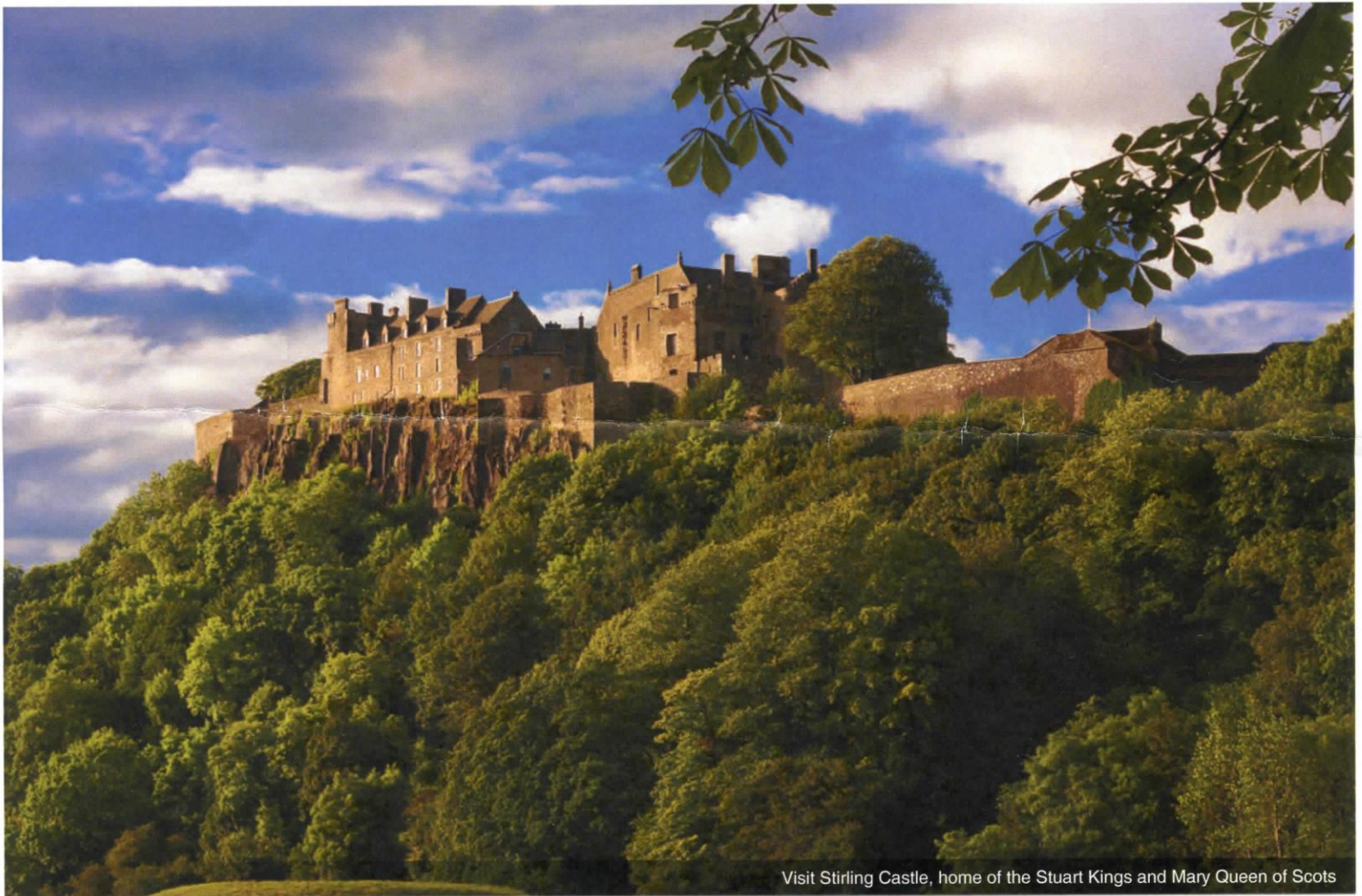
Visit Stirling Castle, home of the Stuart Kings and Mary Queen of Scots