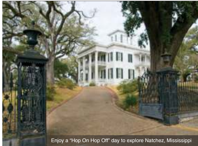
Enjoy a "Hop On Hop Off" day to explore Natchez, Mississippi

DAY 1 Arrive in Louisiana: Arrive in New Orleans, Louisiana today and transfer to your hotel. Meet your tour manager and check in for your cruise at the American Queen Hospitality Desk inside the hotel.