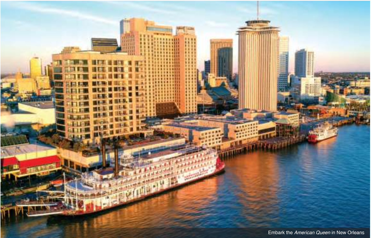
Embark the American Queen in New Orleans