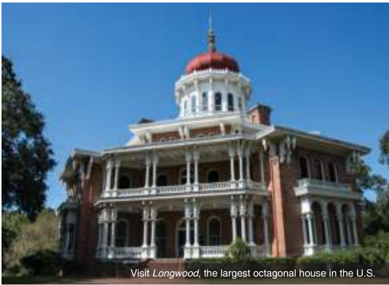
Visit Longwood , the largest octagonal house in the U.S.

picturesque scenery glide by. Or join in the fun of the numerous activities onboard the American Queen . Meals: B, L, D