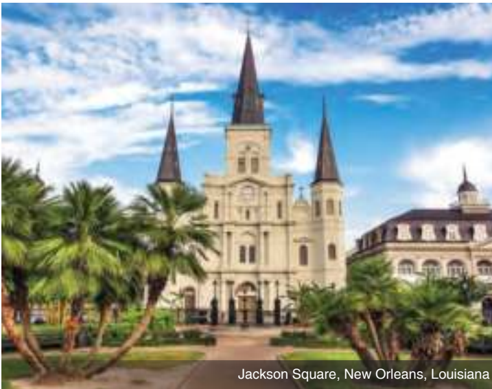
Jackson Square, New Orleans, Louisiana