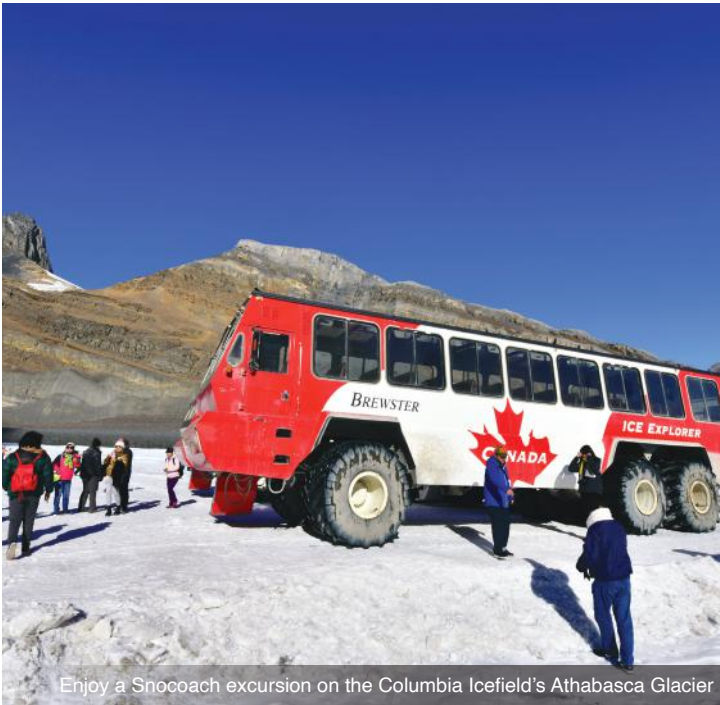
Enjoy a Snocoach excursion on the Columbia Icefield's Athabasca Glacier