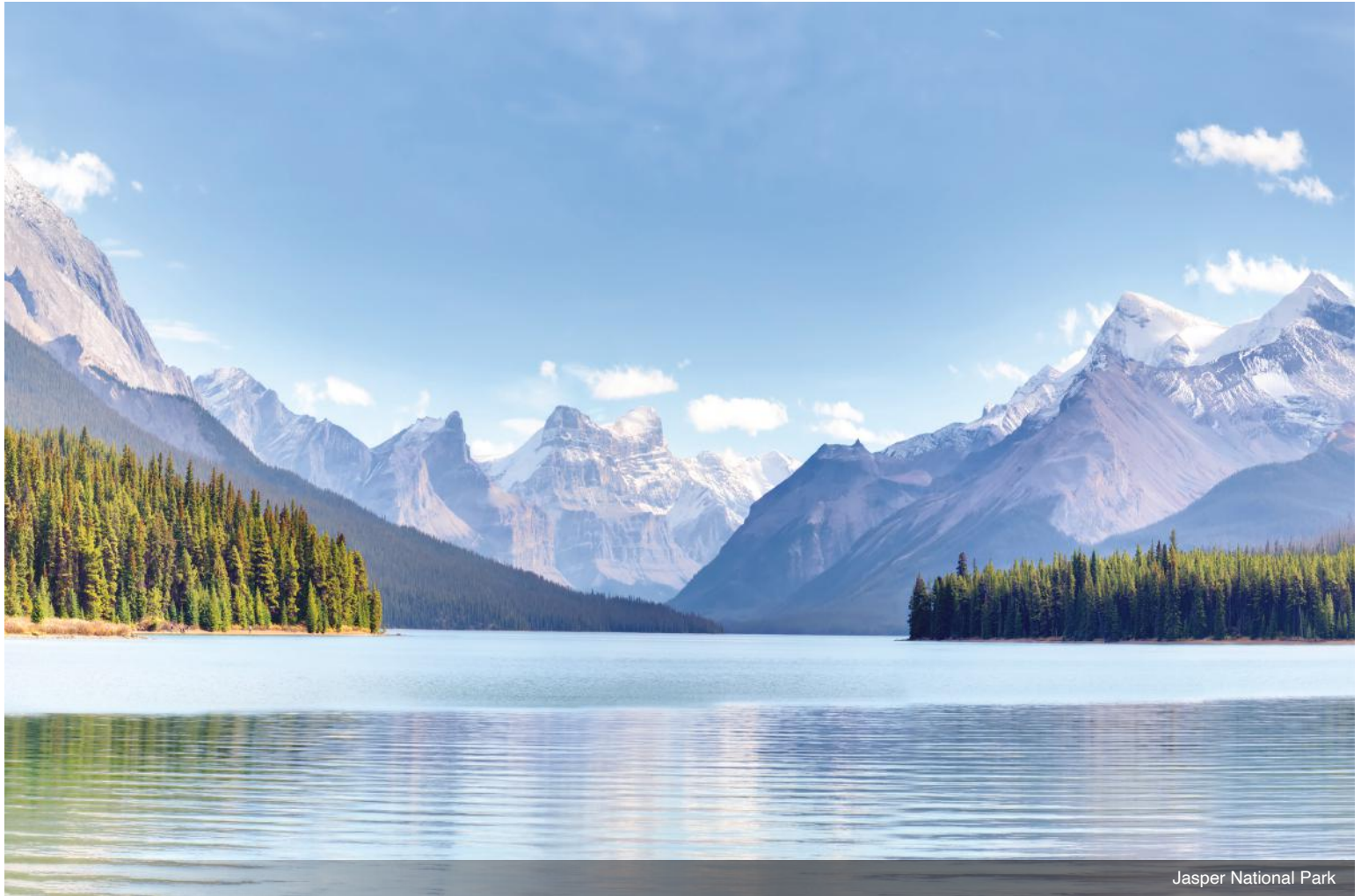
Jasper National Park